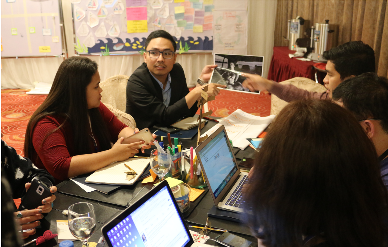
AFS volunteers and staff working through the steps of D.I.V.E. during an intercultural training workshop

she broke it by accident while she was cleaning? Or maybe the most mom was worried about her, thought that she is at risk and wanted to make sure that all was fine? Getting the student to think about multiple interpretations will help her shift her frame of reference and suspend judgment.